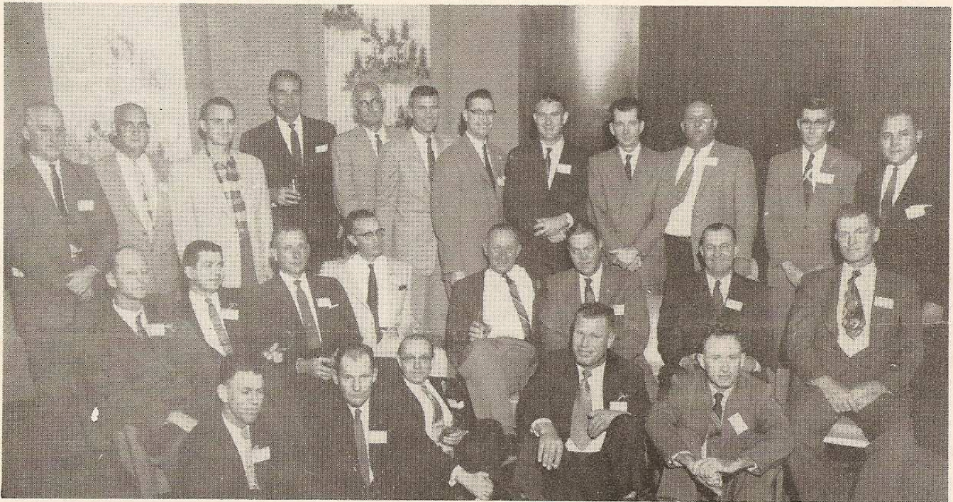
358th COMBAT TEAM MEMBERS AT THE 1956 CONVENTION HELD AT DALLAS, TEX.