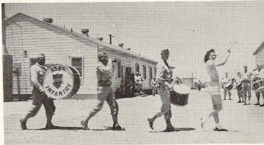
Drum Majorette with 358th Infantry Band at Camp Barkeley, Texas.