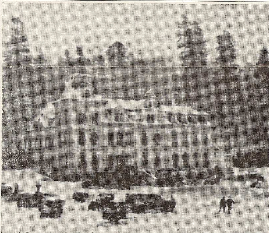
1st Battalion Rest Camp in Belgium after Ober and Neiderwampach during time of Bulge.