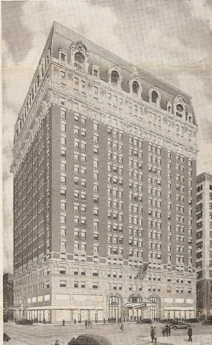
Hotel LaSalle on LaSalle and Madison Streets in Chicago, the headquarters for the Third Annual Convention of the 358th Infantry Combat Team Association. Convention will be held on Saturday, May 27 and Sunday, May 28th. Main Banquet will be at 7:30 P. M. on Saturday.