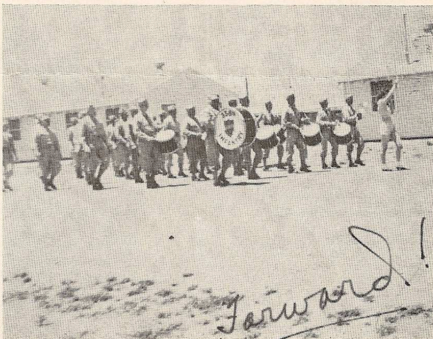
COL. RUSTEMEYER sends this picture showing the only majorette (at the time) in the only regiment in the U.S. Army.