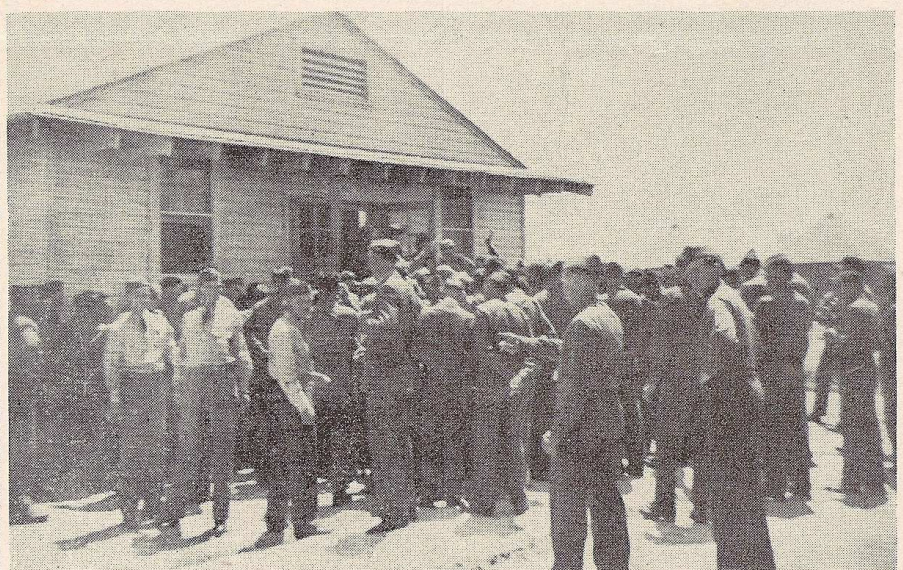
MAIL CALL FOR COMPANY B of the 358th down in Camp Barkley, Texas.

“We had the biggest hunting season ever this year. I kept busy between the motel, school, and guiding for elk and deer. Three different mornings we went out after elk and I was lucky enough to fill their licenses and be back (Continued on page 4)