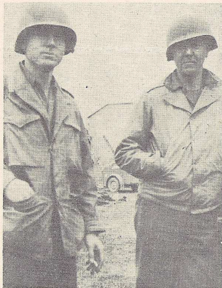
IDENTIFICATION PLEASE! Names of the above 358th men would be appreciated. We think from First Battalion.